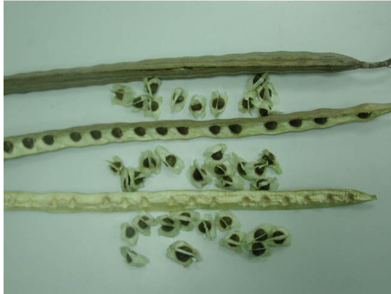
Figure 2. Moringa oleifera Pods and Seeds from Serdang, Malaysia