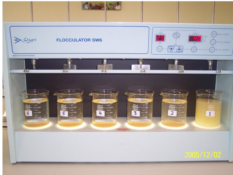
Figure 3. Jar test for high turbidity river water